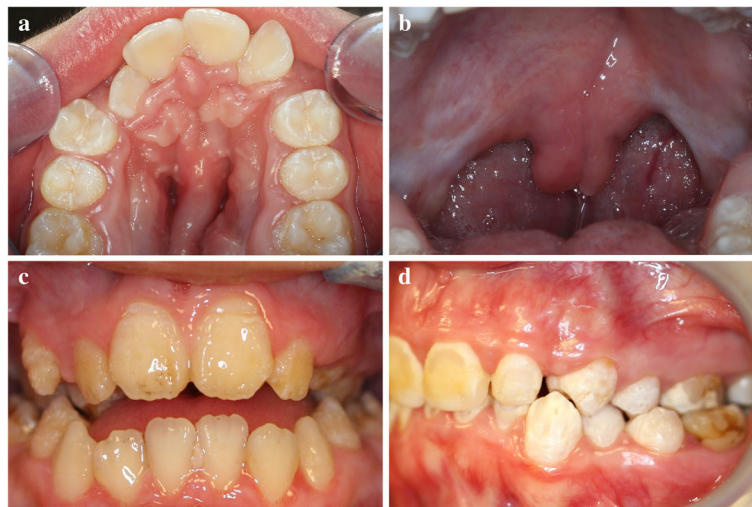
Fig. 2 Representative Photos of Oral Manifestations in LDS Cohort. a High-arched and narrowed palate; b bifid uvula; c structural enamel defect includes pitting enamel and horizontal grooves on enamel surface; d malocclusion includes dental crowding and crossbite

evidenced by crowding of teeth or orthodontic treatment as a treatment of crowding. Abnormal inter-arch relationship was evidenced by overjet (> 3 mm), overbite (> 50%), anterior and/or posterior crossbite (bilateral and unilateral), and/or Angle’s Classification of Class II or Class III using first molars as primary reference and/or canines as secondary reference (if appropriate).