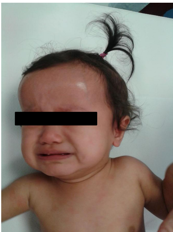
Fig. 2 Typical CINCA/NOMID “facies” featured by frontal bossing, large cephalic perimeter and saddle-back nose

Persistent cochlear inflammation may lead to sensorineural hearing loss usually occurs within the first years of life in a relevant percentage of untreated patients (42% of CAPS patients enrolled in Eurofever Registry, Levy et al.). In a prospective study performed in 2013 by Neda Ahmadi et al. [9], data regarding clinical aspects, audiologic phenotype and fluid attenuation inversion recovery MRI (FLAIR-MRI) were collected in CAPS