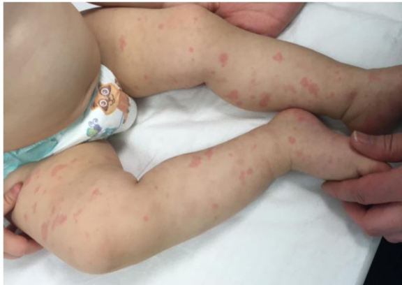
Fig. 1 Urticarial rash of CAPS patient

was reported in 8 patients (26%). Posterior synechia, glaucoma, and white iritis were not observed in any patient.