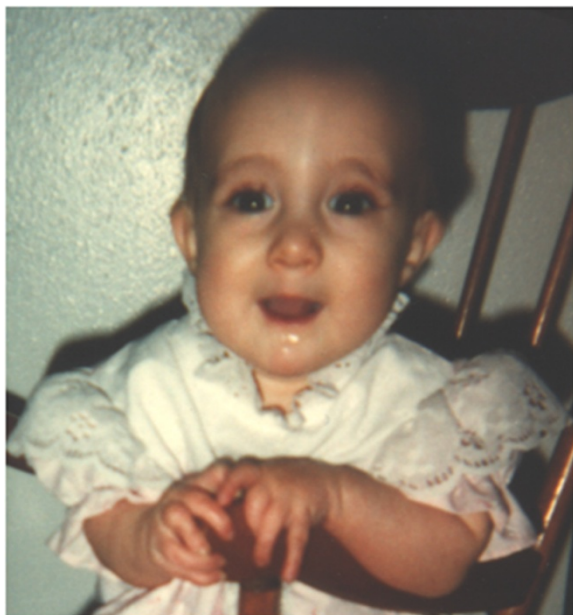
Figure 1 Image of STWS patient at 10 months of age. Facial features and contracture of fingers are evident. Patient carries two mutations in the LIFR gene; 1) a duplication of 22 nucleotides within exon 4, causing a frameshift predicted to result in a premature stop codon following five unique amino acids, and 2) a deletion of nine nucleotides within exon 12, resulting in the deletion of three amino acids at the protein level. Both mutations occur within the region of the gene encoding the extracellular domain. The mutation resulting in the premature stop codon is anticipated to result in mRNA instability, and it is therefore likely to result in a null mutation. These mutations are unique, having not been previously described. Photograph printed with permission from patient, now age 23.