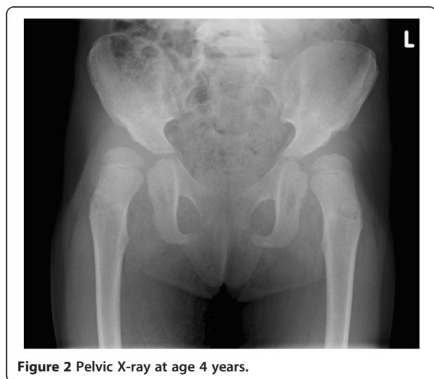
Figure 2 Pelvic X-ray at age 4 years.

As life expectancy of transplanted MPS I patients has increased considerably and total hip replacement is probably an important future treatment option for osteoarthritis of the hips in adult patients both early