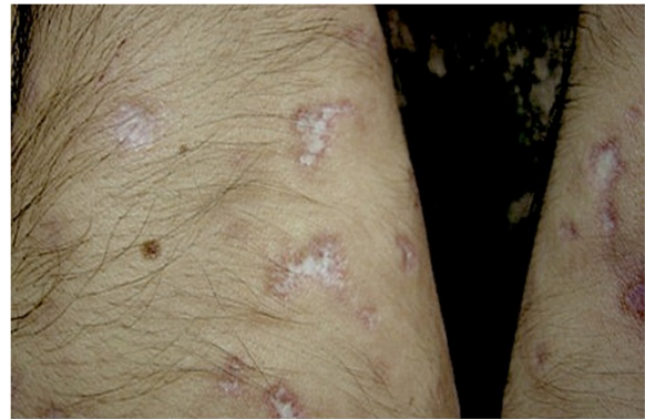
Figure 2 Characteristic lesions with porcelain-white center and a surrounding erythematous rim on the upper extremities of a male patient.

systemic involvement, the first variant - in contrast to the latter "malignant" one - has been termed "benign atrophic papulosis" by some authors [15,16]. However, it is still unclear if these two forms can be unambiguously distinguished from each other, since systemic involvement can develop year after the occurrence of the skin lesions.