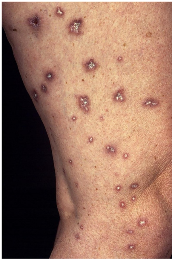
Figure 1 Cutaneous involvement of Köhlmeier-Degos disease showing scattered typical lesions on the lower extremities of a female patient.

Due to the markedly different prognosis between the apparently idiopathic cutaneous disease and MAP with