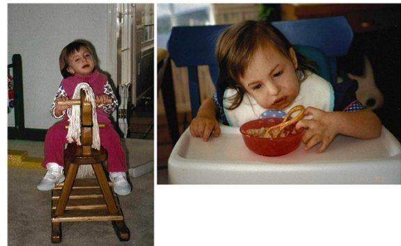
Figure 3 This girl, now 16 years of age and very healthy, had a ventricular septal defect repair as an infant; she is shown here at various ages enjoying a favorite pastime and feeding herself. She is walking with assistance but can climb stairs on her own.

As mentioned above (see "Etiology and Pathogenesis") among patients with mosaic trisomy 18 the phenotype is extremely variable, and there is no correlation between the percentage of trisomy 18 cells in either blood cells or skin fibroblasts and the severity of intellectual disabilities [24].