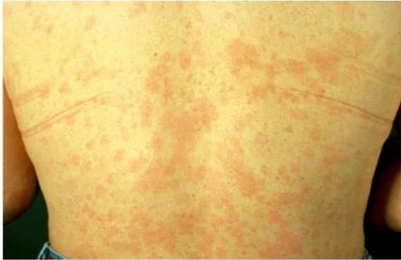
Figure 1 the typical rash of the Schnitzler syndrome, which corresponds to a neutrophilic urticarial dermatosis: rose to red macules and/or slightly raised plaques. The lesions are usually not itchy and vanish within hours without sequel.