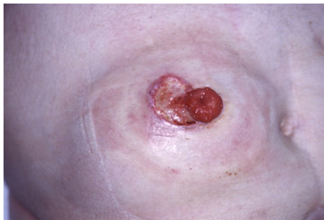
Figure 4 Peristomal pyoderma gangraenosum in ulcerative colitis.

Tumour necrosis alpha inhibitor infliximab was reported to be effective in PG associated with inflammatory bowel disease at a dosage of 5 mg/kg body weight. Infliximab is given by infusion at weeks 0, 2 and 6, and every 8 weeks thereafter. The chimeric antibody is usually combined with low-dose methotrexate for Crohn's disease [54,55]. In a small series including 4 patients with fistulating Crohn's disease and PG infliximab was given either as a single infusion or a series of three infusions at a dosage of 5 mg per kg body weight/day. All patients demonstrated a rapid healing of PG within 4 weeks after starting the treatment. Healing was complete and relapses were not observed [56]. In another study four patients with PG-ulcers and Crohn's disease showed a marked improvement after a single infusion of infliximab [57]. Since infusion reactions can occur in 3% to 17% of patients with Crohn's disease that are antibody associated the concurrent administration of steroids and the use of immunosuppressant like methotrexate or azathioprine has been recommended [58].