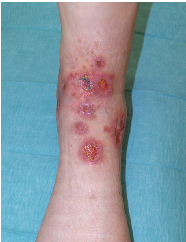
Figure 3 Ecthyma-like pyoderma gangraenosum.

Tumour necrosis alpha inhibitor infliximab was reported to be effective in PG associated with inflammatory bowel disease at a dosage of 5 mg/kg body weight. Infliximab is given by infusion at weeks 0, 2 and 6, and every 8 weeks thereafter. The chimeric antibody is usually combined with low-dose methotrexate for Crohn's disease [54,55]. In a small series including 4 patients with fistulating Crohn's disease and PG infliximab was given either as a single infusion or a series of three infusions at a dosage of 5 mg per kg body weight/day. All patients demonstrated a rapid healing of PG within 4 weeks after starting the treatment. Healing was complete and relapses were not observed [56]. In another study four patients with PG-ulcers and Crohn's disease showed a marked improvement after a single infusion of infliximab [57]. Since infusion reactions can occur in 3% to 17% of patients with Crohn's disease that are antibody associated the concurrent administration of steroids and the use of immunosuppressant like methotrexate or azathioprine has been recommended [58].