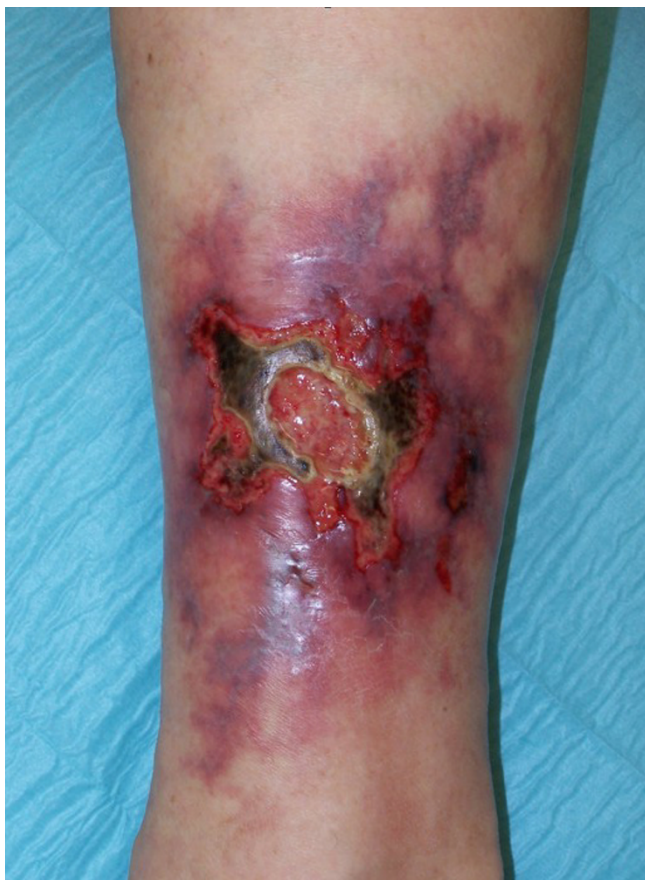
Figure 1 Acute rapid growing pyoderma gangraenosa with undermined violaceous borders.

a deep suppurative folliculitis with dense neutrophilic infiltrate. In about 40% of cases, leukocytoclastic vasculitis is present. PG with [necrotizing] granulomatous inflammation has been described [3,34,37]. These reports illustrate the difficulties of a diagnosis based solely on histopathology since concomitant occurrence of PG and systemic necrotizing vasculitis has been observed.