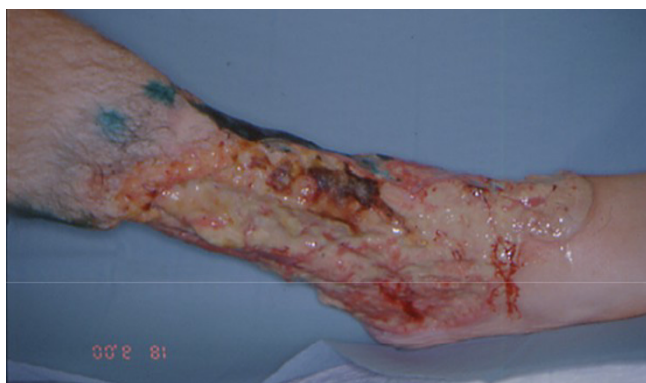
Figure 5 Deep purulent ulcerations due to pyoderma gangraenosa. In this patient later on a lower limb amputation was necessary, since he did not response to drug therapy.

For small flat lesions without secondary infection, topical high potent corticosteroids are in use. They are rarely capable of inducing remissions except in peristomal PG [4,10,11]. Topical calcineurin inhibitors like tacrolimus or pimecrolimus were used in some cases with success [4,63,64]. Dramatic improvement has been observed in particular in peristomal PG [65,66].