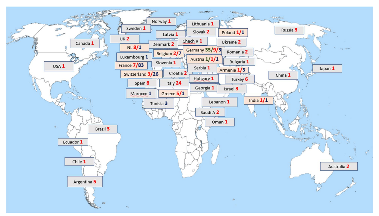
Fig. 1 Overview of centres participating in Eurofever, JIRcohort and AID-Net. *Marked red—centres participating in Eurofever. Marked blue—centres participating in AID-Net. Textboxes colored orange—potential overlap between the patients in different registries

and follow-up on patients previously included. The information summarized in the registries covers not only pediatric patients but also adults with newly diagnosed AIDs and a different proportion of the previously diagnosed ones (Table 1).