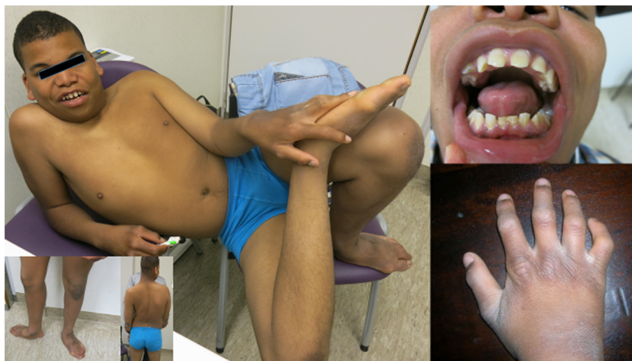
Fig. 1 The patient at age 13 years. Note facial dysmorphism, exorotation of the feet and keratoderma of the dorsum of the right hand

The patient had no obvious clinical bleeding problem and his Ivy bleeding time was normal as were all blood cell counts. Repeated platelet function testing showed decreased aggregation responses for ristocetin, ADP, epinephrine and Horm collagen (Fig. 3a). A similar multi-agonist platelet activation defect was detected using a high-throughput ELISA that records dose response activation of platelets where monoclonal