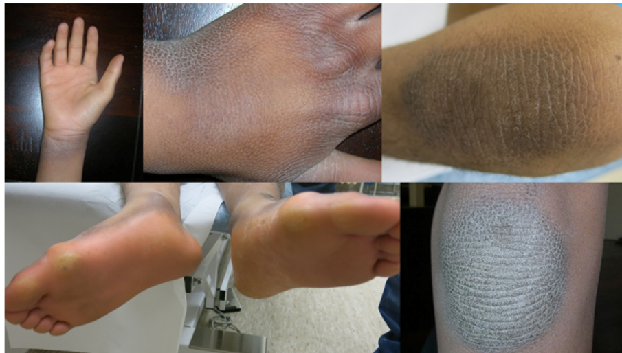
Fig. 2 Keratoderma of the hands, foot soles and knees of the patient at 13 years

antibodies against P-selectin (CD62P) or \alpha Ib \beta 3 and GPIb \alpha were used to capture and detect platelet activation with ADP, U46619, TRAP and CRP [9] (Fig. 3b). In contrast, ATP secretion from dense granules after stimulation with 2 \mu g/ml Horm collagen was normal (4.1 and 4.8 \mu M; normal range of 2–7 \mu M). As mentioned above, the patient is on valproate therapy that is known to have slight effects on the arachidonic pathway of platelets. However, the observed broad platelet