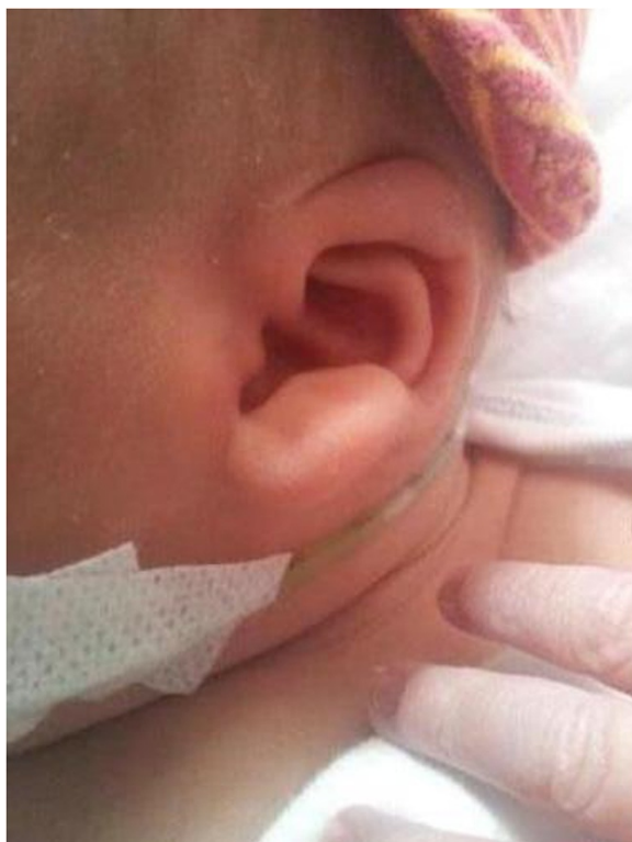
Figure 1 Mowat-Wilson syndrome, facial characteristics. The typical large and uplifted earlobes in Patient 30, who was diagnosed with Mowat-Wilson syndrome based on clinical data.

during mini-puberty was suggestive of 17\beta -HSD deficiency in two patients (case 1: T/A ratio 0,19; case 2: T/A ratio 0,52) and after HCG stimulation in one case (case 17: T/A ratio 0,08) [21,22]. HSD17B3 sequencing was performed in all three cases but revealed no causal mutations. In patient 2 a heterozygous missense variant was identified, c. 866G > A (p.Gly289Asp), although mutation prediction programs indicated this variant to be tolerated. In patient 24, a T/DHT ratio of 10,8 was found at basal sampling during mini-puberty but SRD5A2 sequencing revealed no mutations.