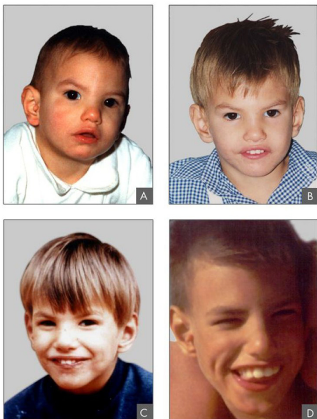
Figure 1 Clinical features of a patient with Cri du Chat syndrome at age of 8 months (A), 2 years (B), 4 years (C) and 9 years 6/12 (D).

Myopia and cataract have been reported. Hypersensitivity of the pupil to methacholine and resistance to mydriatics, probably due to a defect of the pupil dilator muscle, have also been described [29,30]. These features have also been found in four patients with Goldenhar's syndrome associated with CdCS [31,32]. Scoliosis, flat foot, pes varus, inguinal hernia and diastasis recti are frequent. Two patients with joint hyperextensibility, skin hyperelasticity and other features of Ehlers-Danlos syndrome [5], and one patient with both clinical manifestations of CdCS and Marfan syndrome have been reported [33]. A patient with a small deletion in 5p15.33 and phenotype suggesting Lujan-Fryns syndrome has been described [34].