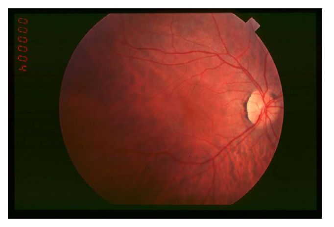
Figure I Fundus of patient with retinitis pigmentosa, early stage.

In the mid stage, the clinical picture is complete. Night blindness is obvious, with difficulties to drive during the night, and to walk at evening and in dark staircases. Patients become aware of the loss in the peripheral visual field in day light conditions through stereotypic situations: while driving, they do not see pedestrians or sidecoming cars, they miss hands in handshaking and frequently step into various objects. Consequently, patients adapt themselves by avoiding night driving and circulation in unfamiliar places. Dyschromatopsia to pale colors (particularly blue and yellows hues) is often present. In addition, patients become photophobic, especially in presence of diffuse light (white cloudy weather). This leads to reading difficulties, with a narrow window between insufficient and too bright light. Difficulties with reading are due also to decreased visual acuity, partly because of macular involvement (macular edema or mild foveomacular atrophy) and subcortical posterior cataract. Fundus examination (Figure 2) reveals the presence of bone spicule-shaped pigment deposits in the mid periphery, along with atrophy of the retina. Narrowing of the retinal vessels is evident and the optic disc is moderately pale. In contrast, the extreme periphery and the macular region appear relatively spared, although mild macular